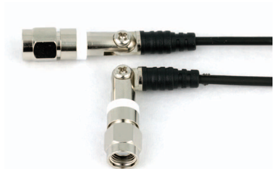
The hinged joint pivots in both directions